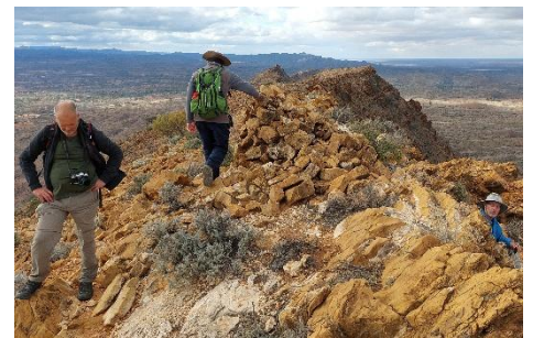
Escape to Mt McCallum, 3 on the cold summit ▶