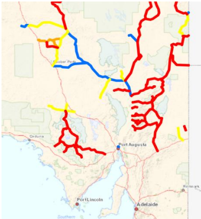
◀ Closed roads gave us two days of rest and frustration.