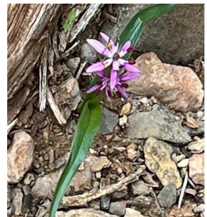
A lonely little Early Nancy in the dry at Bunyeroo ▶