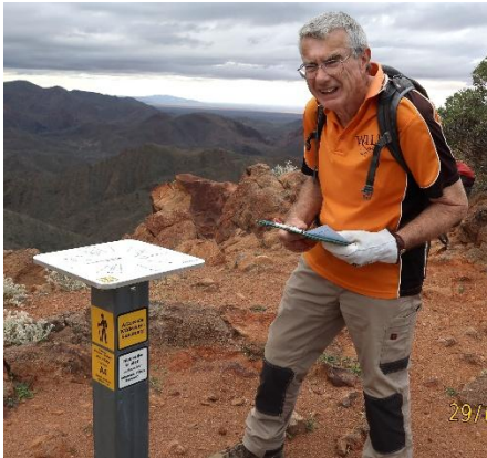
◀ Happy Asset Checker on Acacia Ridge