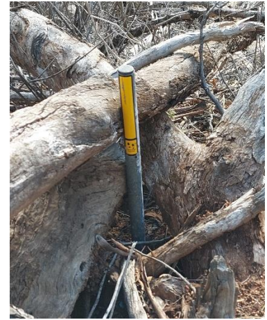
Lost is found – Immovable in droughted Italowie T-tree ▶