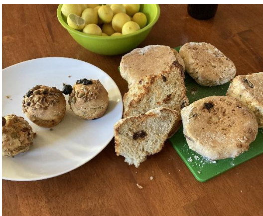
◀ Breakfast crunch and juice at Oraparinna